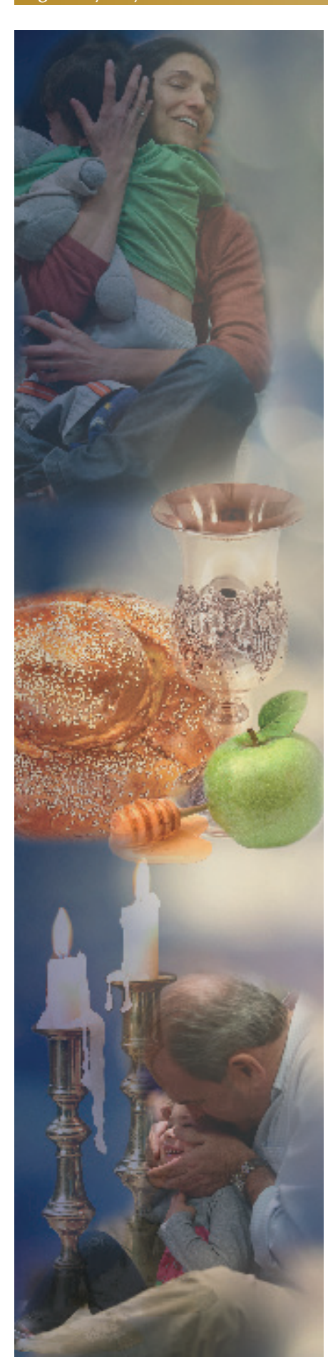
Page 14 | WHC Journal – September 2019